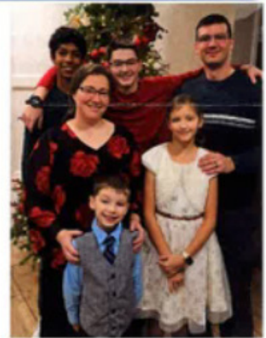
Above – Christmas family photo